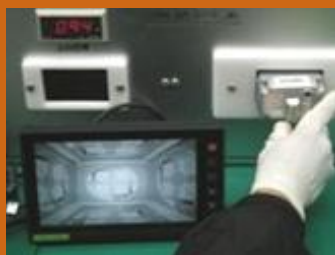
Low Luminance Tester