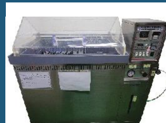
Salt Spray Chamber