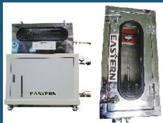
High pressure Waterproof Chamber