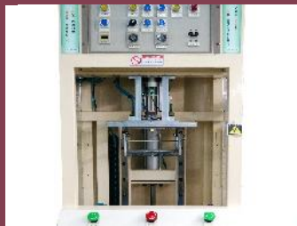
High pressure Waterproof Tester for Monitor