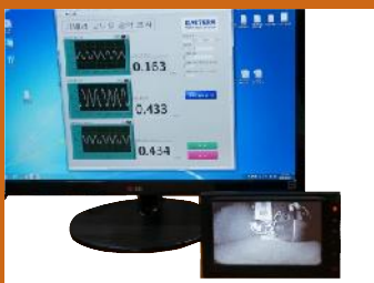
Audio/Video Automated Inspection Tester