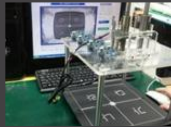
Optical Axis Correction Tester