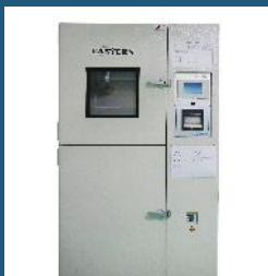
Thermal Shock Chamber