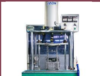
High pressure Waterproof Tester for Camera