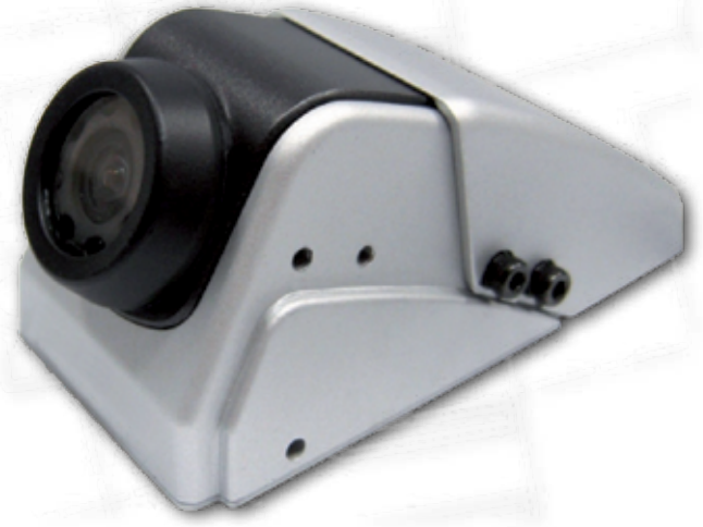
Assembly Option 2: