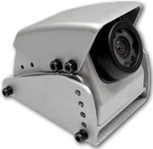
Assembly Option 1: